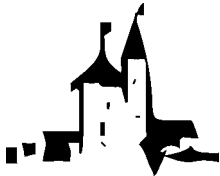
A Text and Picture box at original size

The Castle Press 1222 North Fair Oaks Avenue Pasadena, CA 91103 800-794-0858 www.castlepress.com