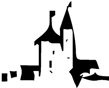
C Text and Picture box scaled proportionally